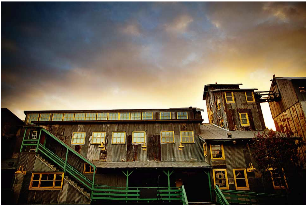
Above: Exterior showing the original lima bean and grain processing warehouse.

The building is on the National Register of Historic Places, so most of the original features are actually protected by law, which means we couldn't change them even if we wanted to – which we don't.